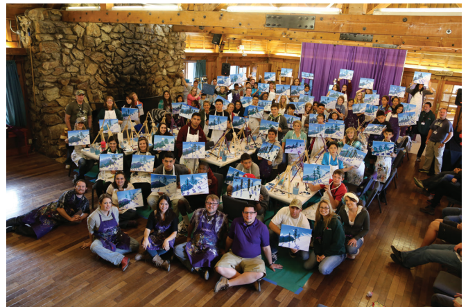
Campers show off their wonderful paintings thanks to Purple Easel!

Campers got to experience a number of educational and fun activities including NASA's mobile planetarium, Bowling at The Bowling Barn in Big Bear Lake, an instructor led painting class put on by Purple Easel, and an hour of entertainment hosted by Fantastic Patrick which had the whole camp laughing until it hurt. These activities were in addition to the typical camp activities, like playing games, arts and crafts, and outdoor play! The group also got to work together in teams through a series of team building activities and then entertained the camp with a number of skits performed by each cabin. In addition to the fun aspect of camp, a team of trained social workers and therapists led the group in support sessions to help them re-establish and enhance their self-esteem.